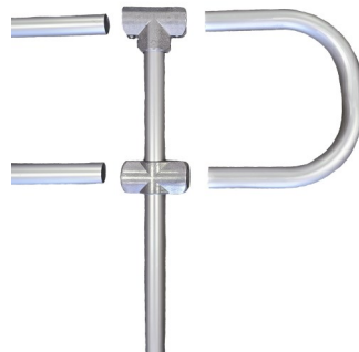
Loop End Assembly