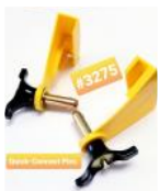
Quick Connect Pins