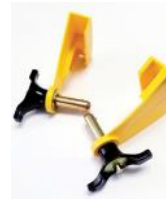
Quick Connect Pins