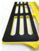
Upper Load-Bearing Approach Plate with rubber backing