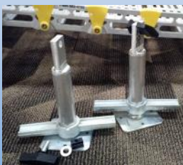
Adjustable Support Stands