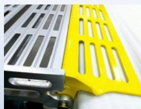
Heavy Duty load-bearing upper approach plate