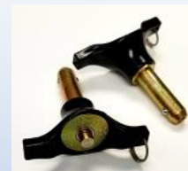
Quick Connect Pins