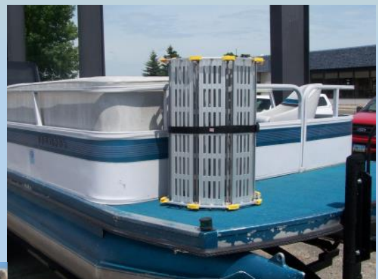
Easily removed or stored on-board