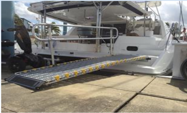
Pictured: 30" x 8' Boat Ramp, 1 handrail w/ Loop-End upgrade and secured with optional Seg-Mount Brackets