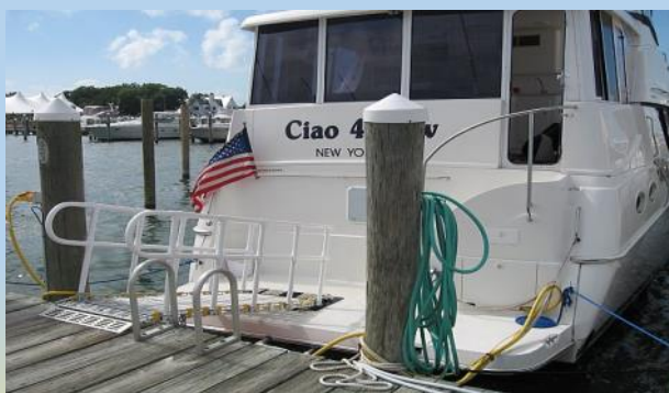
Pictured: Roll-A-Ramp on yacht. White style handrails no longer available.

Choose Ramp Only or Ramp w/ Handrails packages available