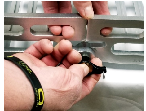
Connect sections to make ramps without tools Push button—Insert pin—release button—securely locks