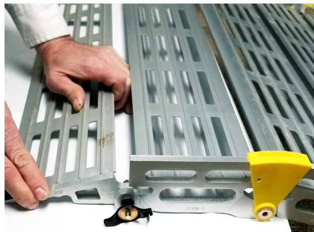
Quickly add Approach Plates to create ramps