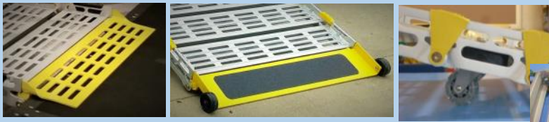
Easily removed or stored on-board

Ramp only and Ramp with Handrails Packages available