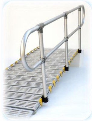
Safe and Sleek

Adds additional safety & security to any ramp